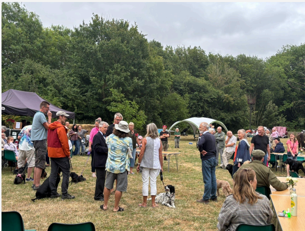
Village Day on the 4th and the Village show on the 11th!