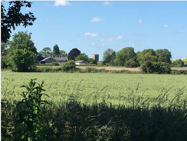
Horningsea from a distance.