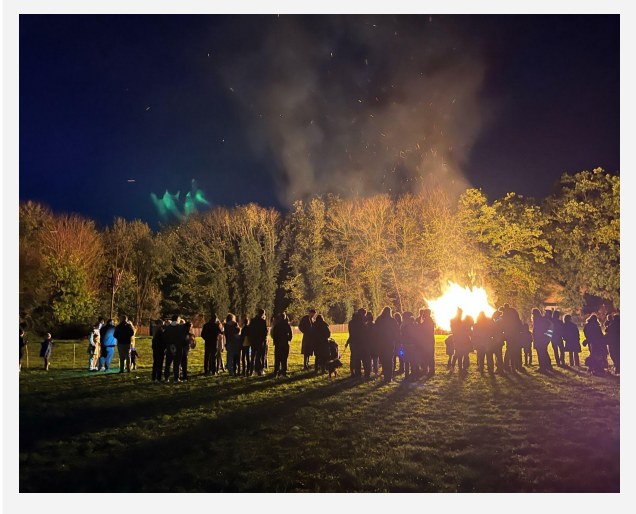
Horningsea bonfire and fireworks on Sunday 5th Nov