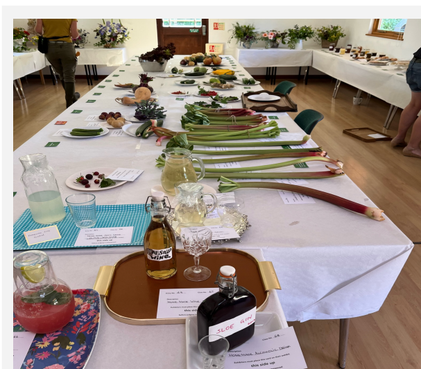
The 67th Horningsea Horticultural show is this month