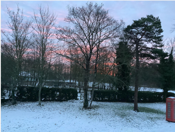
A Horningsea sunrise in the snow