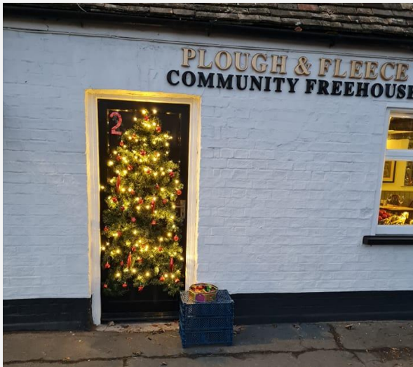
Horningsea's Advent Windows