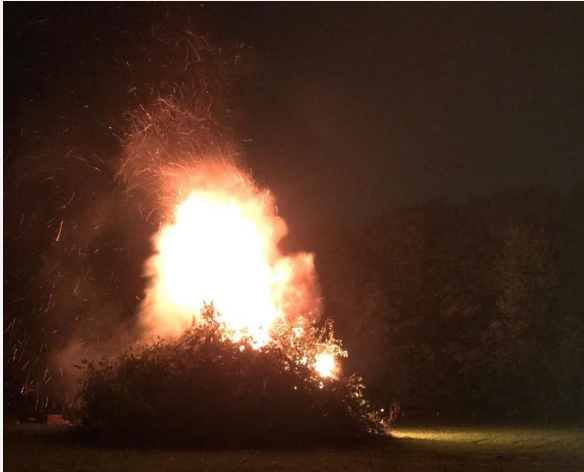
HRA Bonfire night returns