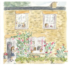
cards, prints, originals, gifts commissions for all occassions & bespoke house paintings