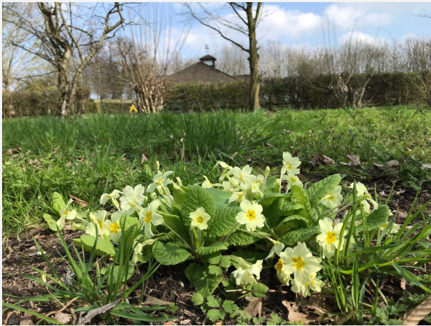
A spring orchard.