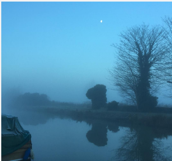
A frosty Horningsea morning.