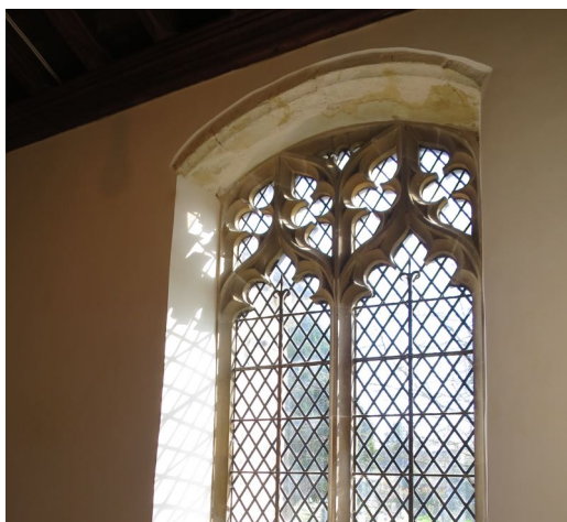
St Peter's Church is looking good!!